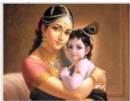
Fig: 1 Image for Edge detection