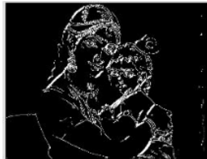
Fig: 2 Proposed Edge Detection

The comparison of proposed edge detection with of edge detection to sobel or prewitt edge detection. Black pixel indicates that this pixel is common for proposed and sobel/prewitt. Red pixel indicates that this pixel is only for sobel/prewitt. And blue pixel indicates that this pixel is only for proposed.