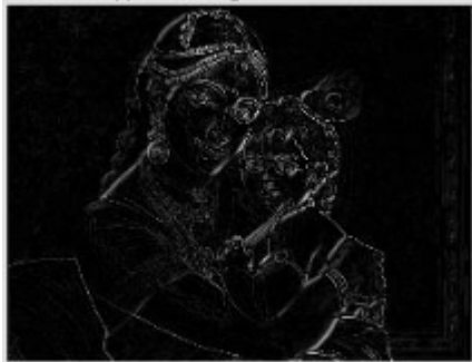
Fig: 3 Sobel Edge Detector