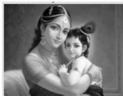
Fig: 2 Image after Advanced Filters